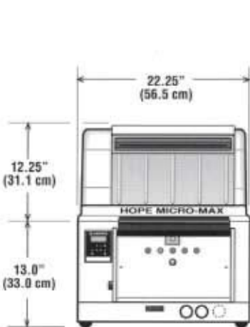
FRONT VIEW (FEED END)

Hope X-Ray offers a one year warranty on all parts.